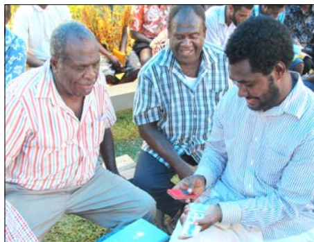
White Sands speakers listen to mega voice